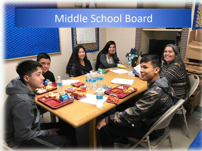
Middle School Board