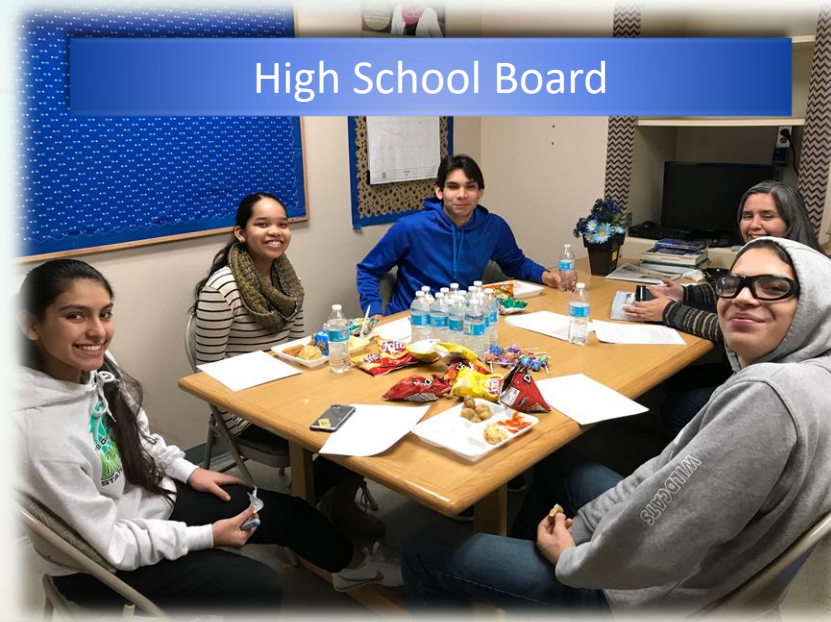
High School Board

Advisory Board Meetings Wednesday, February 21, 2018