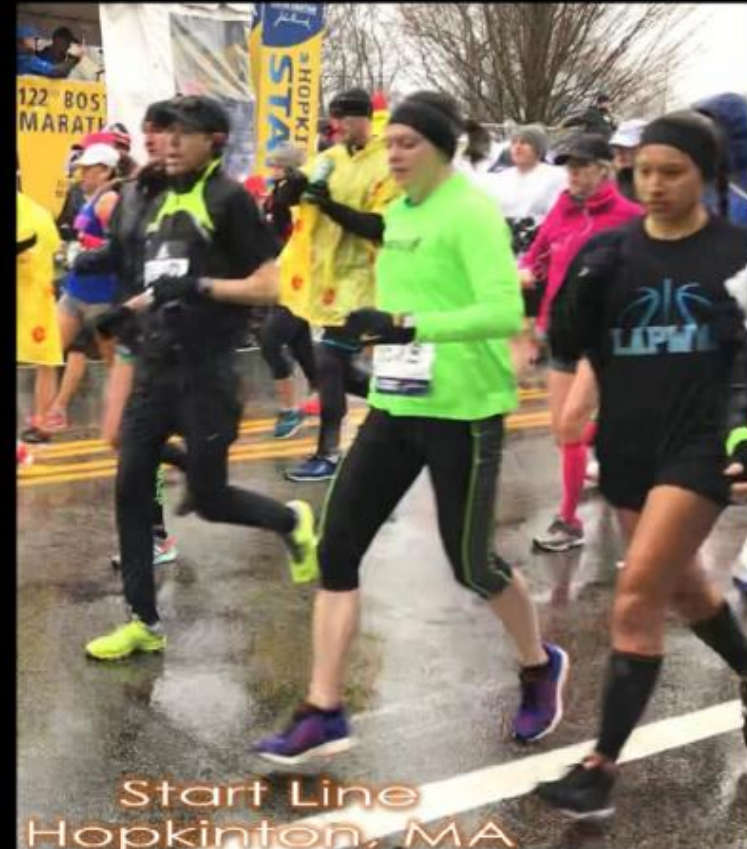
Start Line Hopkinton, MA