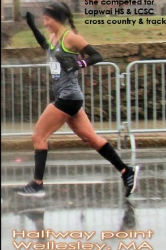
Halfway point Wellesley, MA

She competed for Lapwai HS & LCSC cross country & track.