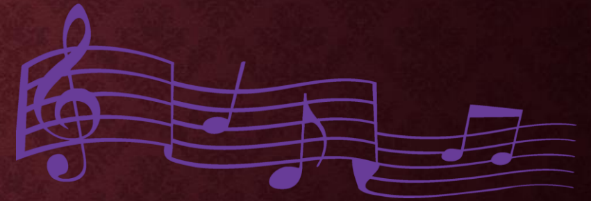
Middle School Choir Performing for 2 nd Grade