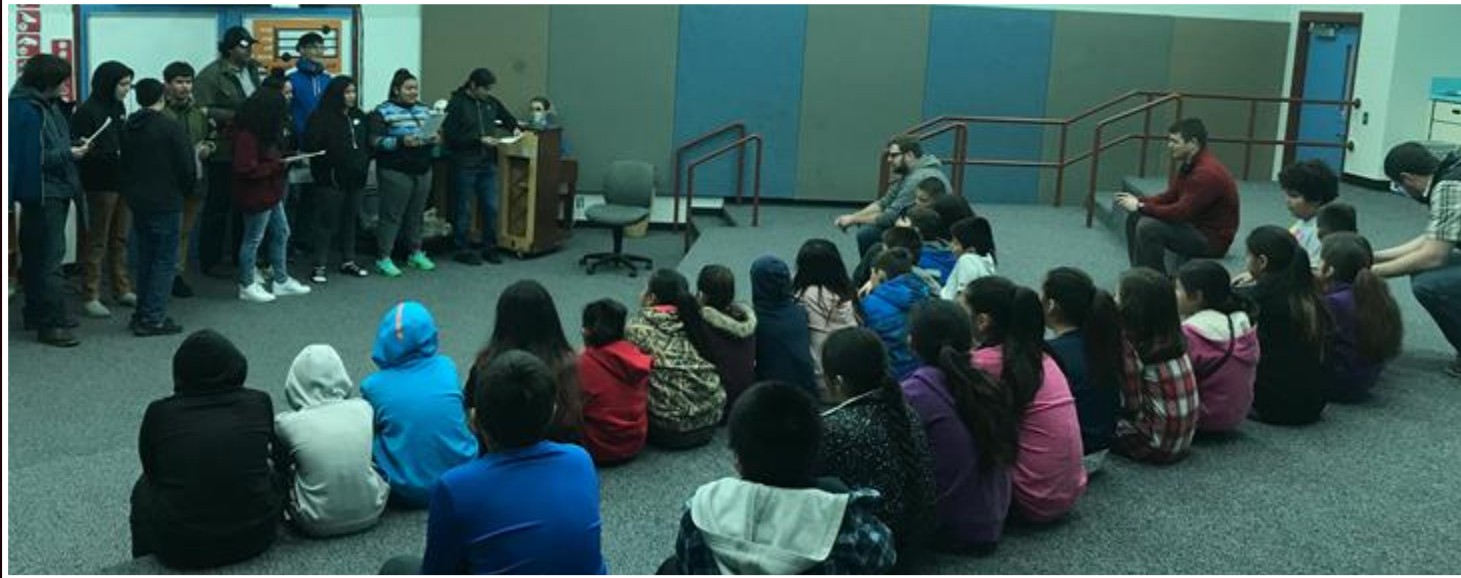
High School Choir Performing for 4 th Grade