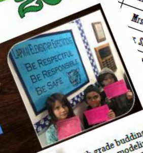
5th grade budding scientists modeling their new lab coats!

BE RESPECTFUL QA'ANNO 'EE BE RESPONSIBLE TIMMIYUNIN 'EE WIC'EYYU' BE SAFE 'EE 'IMAT'YANO' Lapwai Elementary School Principal: [Name] Assistant Principal: [Name]