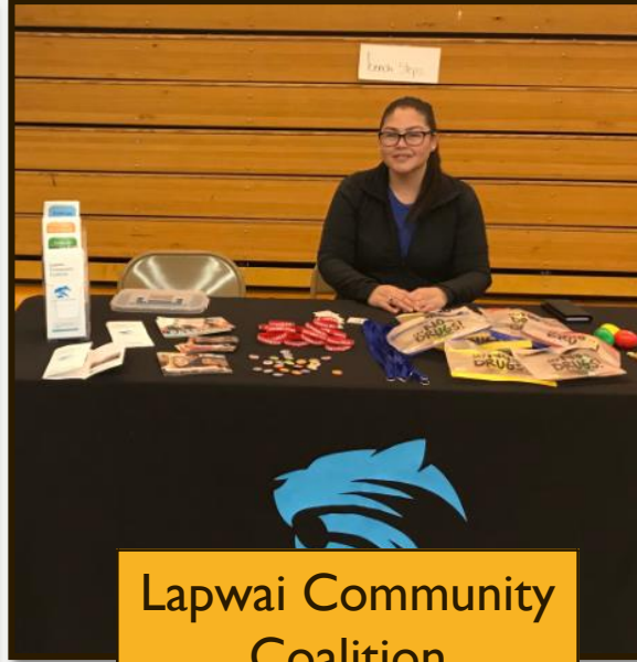
Lapwai Community Coalition