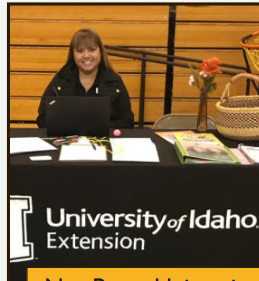
Nez Perce University of Idaho Extension