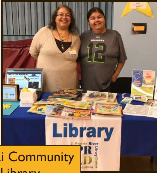
Lapwai Community Library