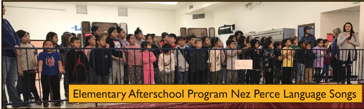
Elementary Afterschool Program Nez Perce Language Songs