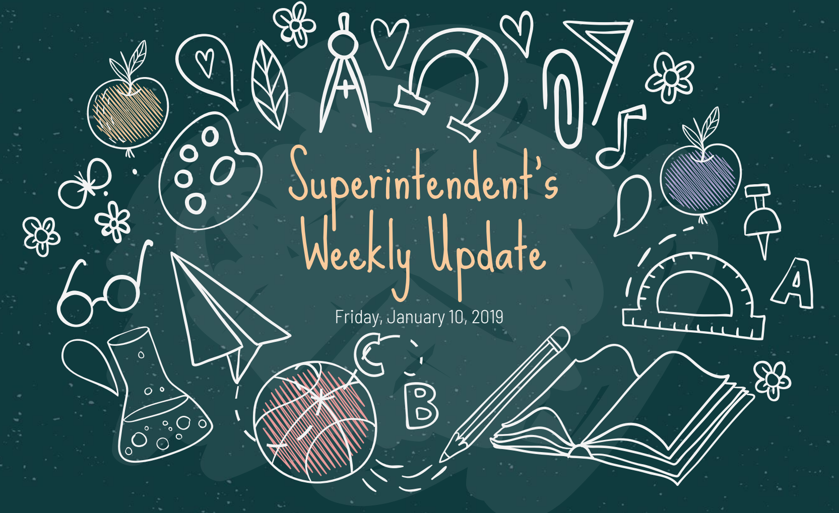
Celebrations & Pictures of Wildcat Scholars & the Dedicated Staff Who Serve Them