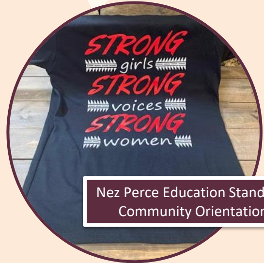
Nez Perce Education Standard: Community Orientation