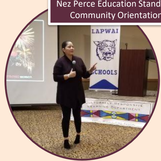
Nez Perce Education Standard: Community Orientation