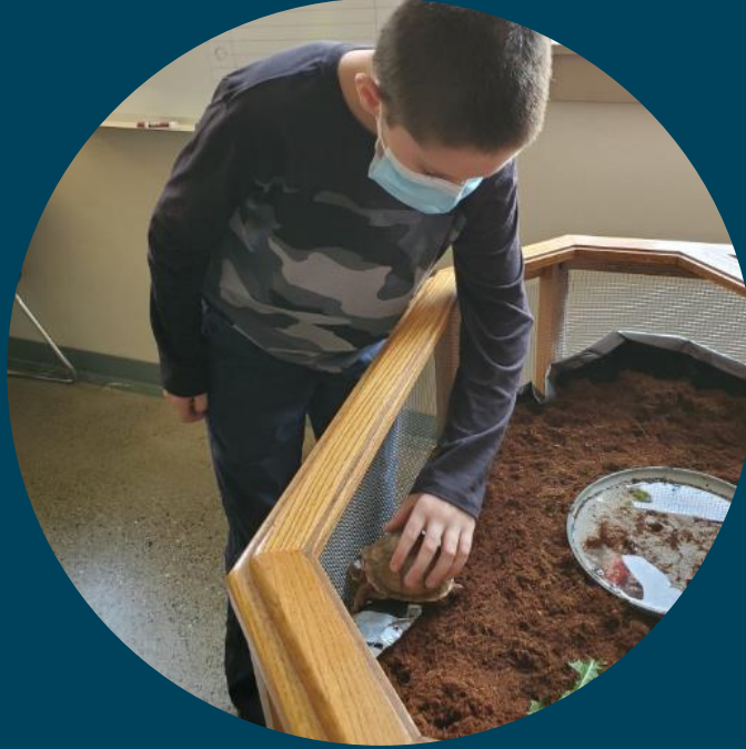
Caring for Class 'Áacix Turtle

Nez Perce Cultural Principle: Learning From Mistakes