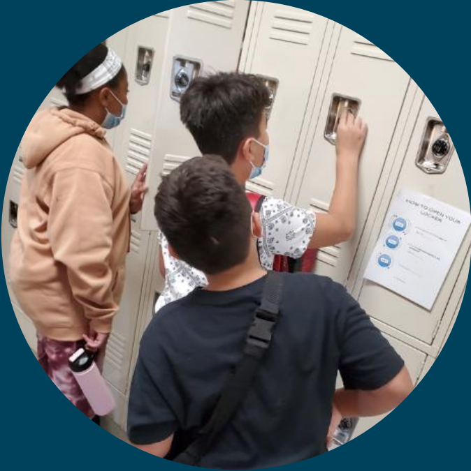
Learning to Use Lockers

Nez Perce Cultural Principle: Learning From Mistakes