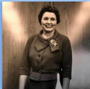
Mary Golda Ross