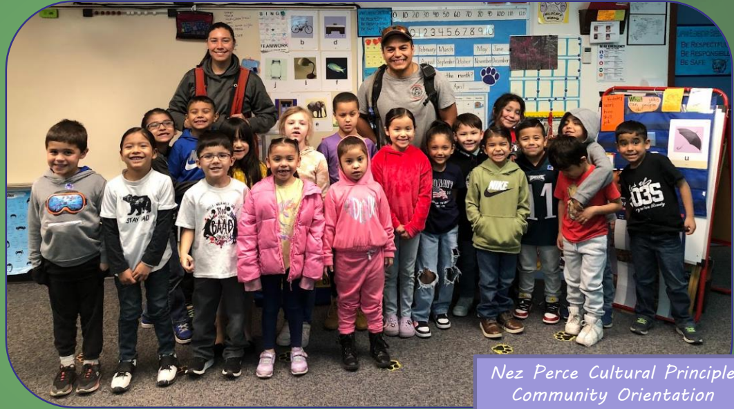
Nez Perce Cultural Principle Community Orientation