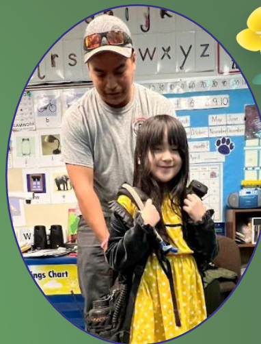
Nez Perce Cultural Principle Community Orientation