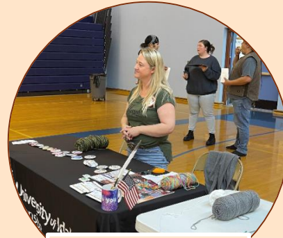
Nez Perce University of Idaho Extension