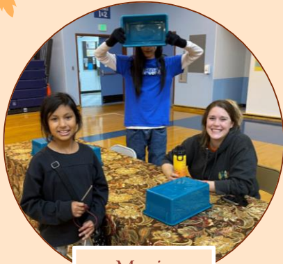
Music Exploration Station