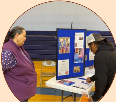
Nez Perce State Tribal Education Partnership