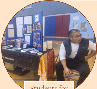
Students for Success