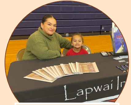
Lapwai Indian Education Department