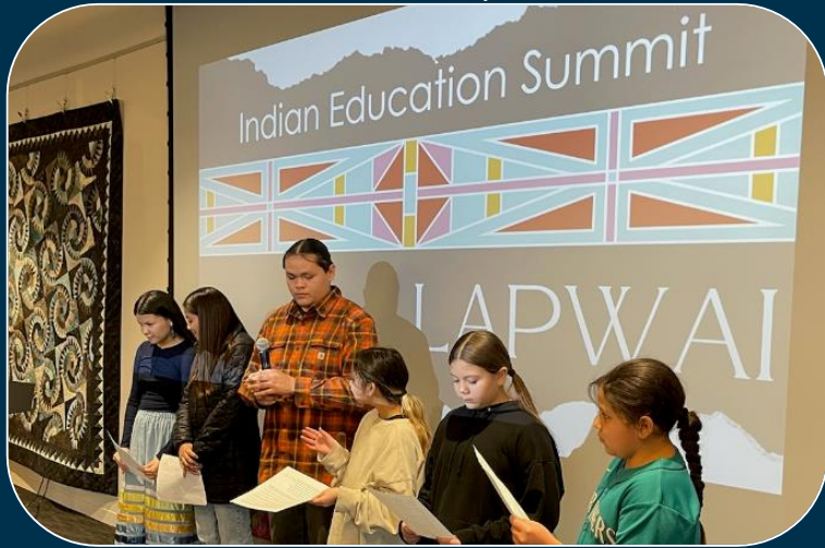
2023-2024 Lapwai School District Superintendents Student Cabinet