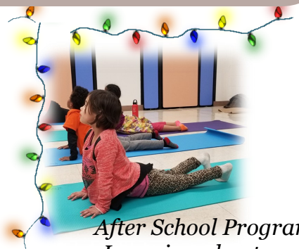
After School Program: Learning about yoga and nutrition!