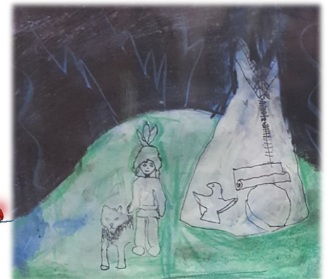
2nd grade artists